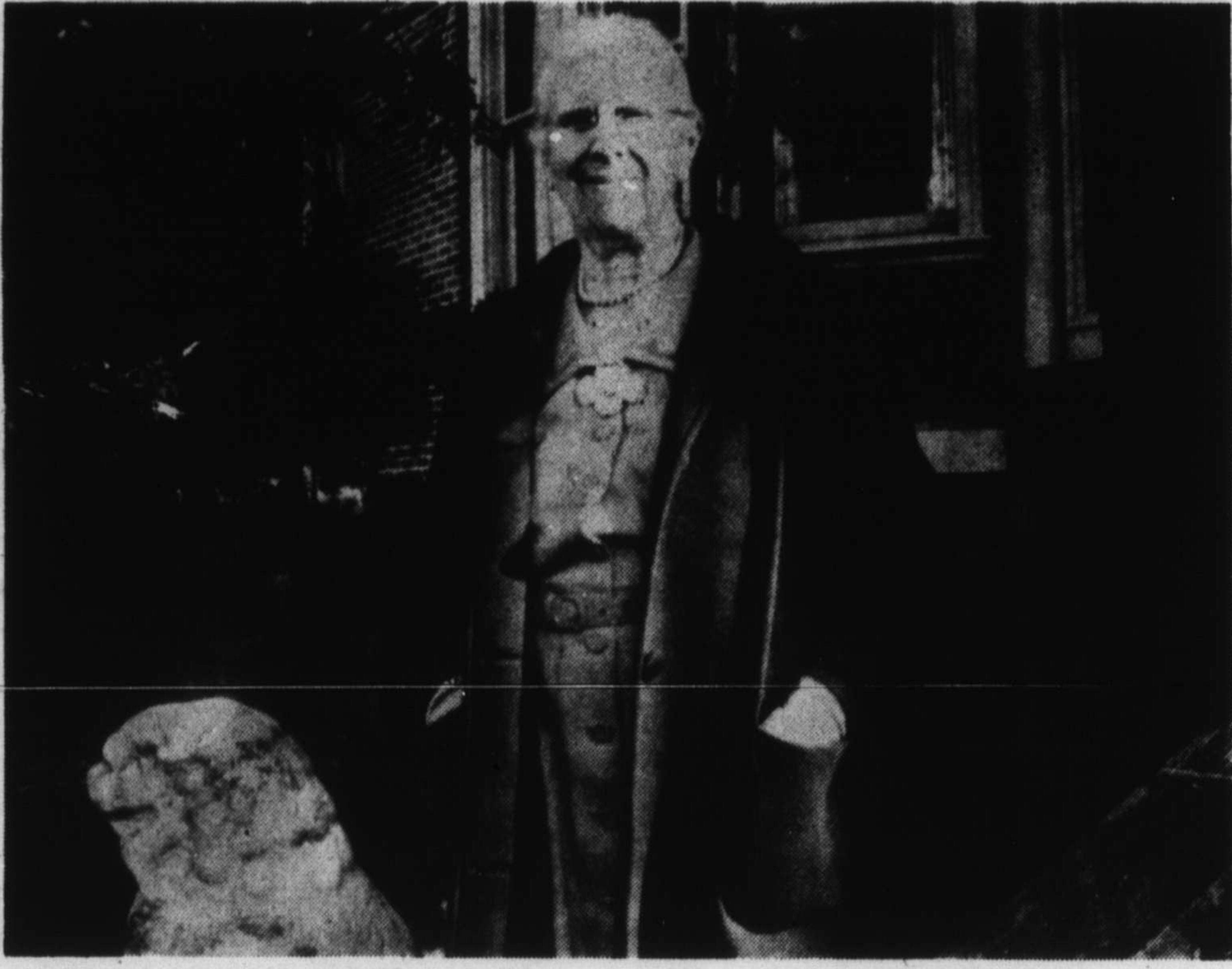
"The Apple" -- 92 and still coaching hockey.