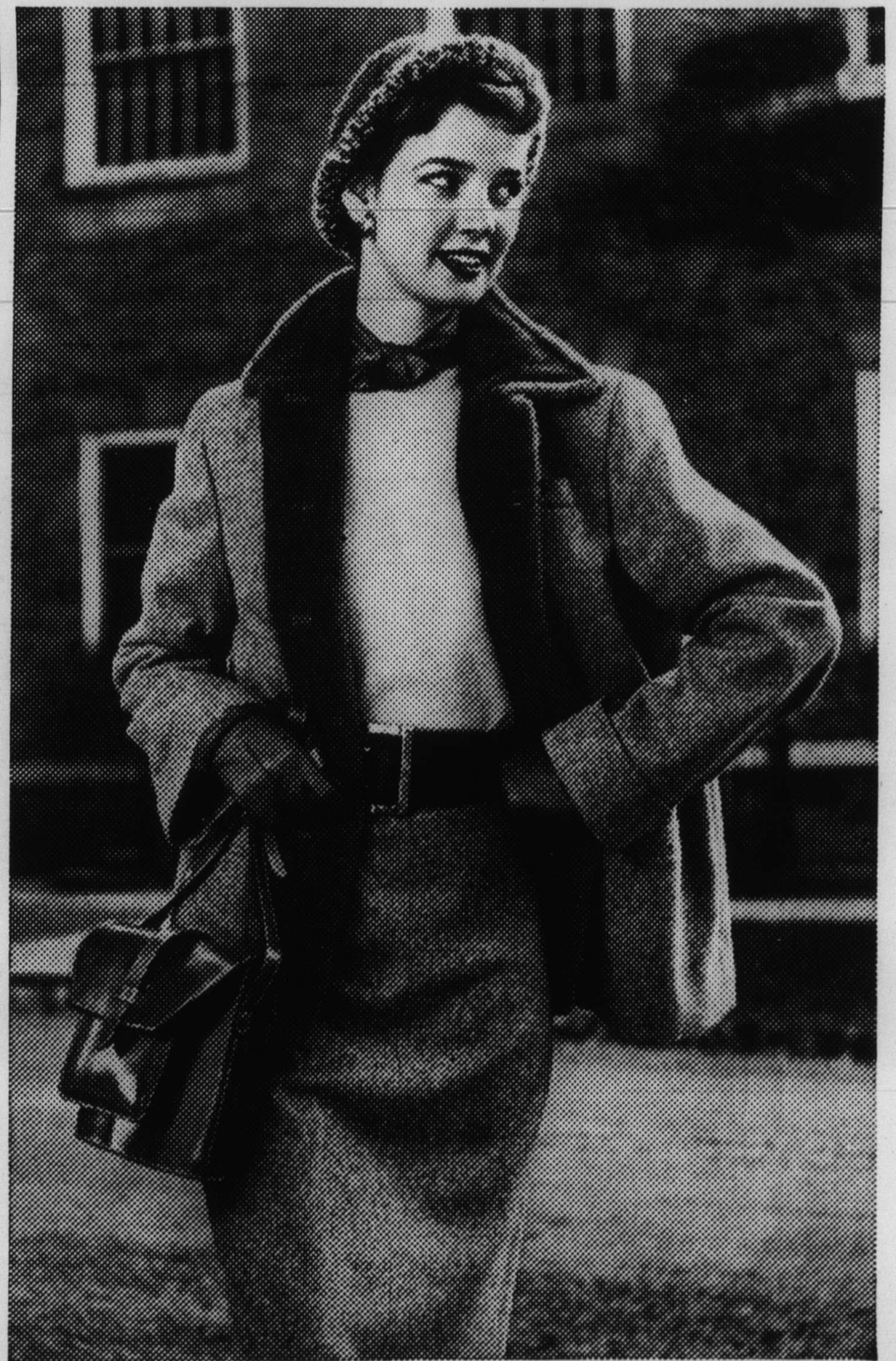
Photographed at COOPERSTOWN, N. Y.

News comes in a box, addressed to juniors!