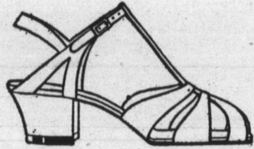
Sandalfoot hose $1.50 - $2.25 pair

It's smart to be comfortable in these low-heel slippers, and you can wear them a full size smaller. White satin is $2.25 (tinting $1.00), gold kid $10.00, silver kid $9.00