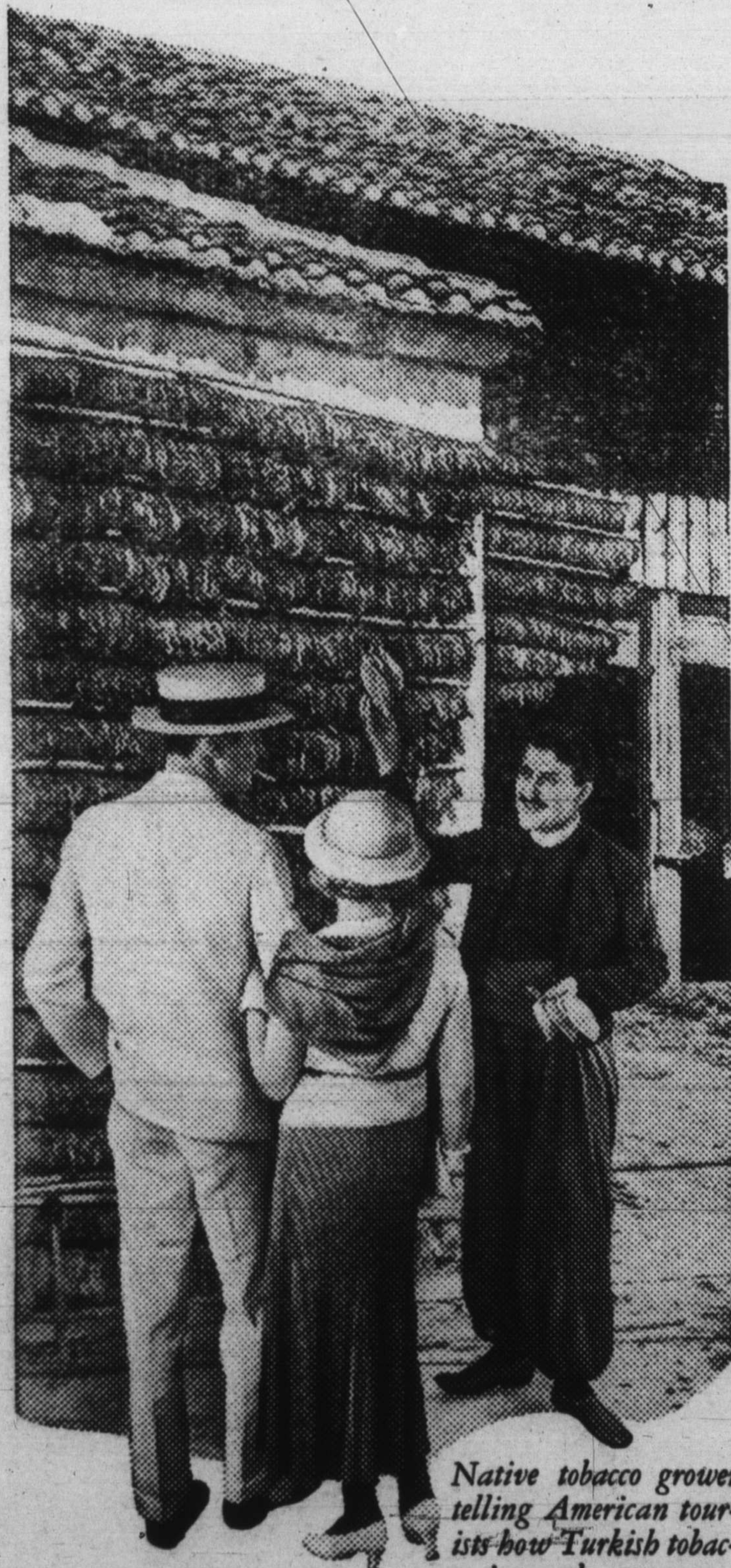
Native tobacco grower selling American tourists how Turkish tobacco is cured.

On the sunny slopes of Smyrna . . . in the fertile fields of Macedonia . . . along the shores of the Black Sea . . . grows a kind of tobacco that is different from any other tobacco in the world.