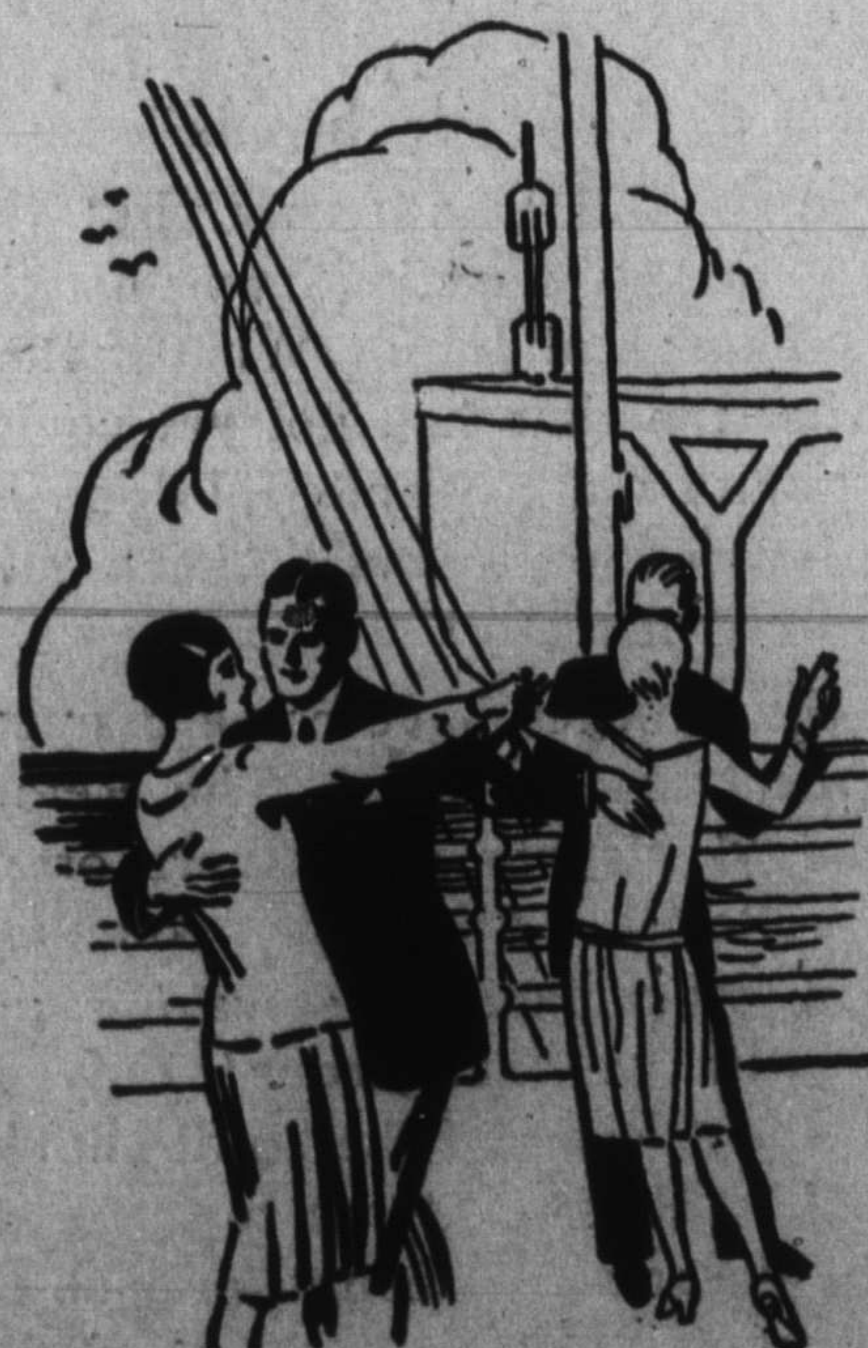
Dancing on deck is one of the delights of the voyage

THE PARKER PEN COMPANY JANESVILLE, WISCONSIN